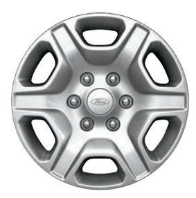
17" ALLOY WHEEL Standard